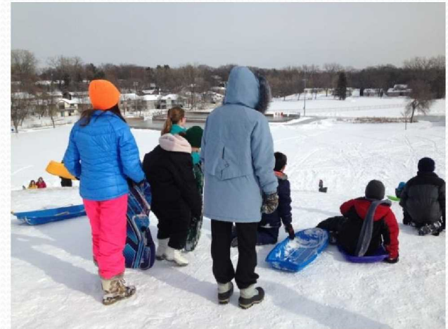
Valley Place Park – City of Crystal